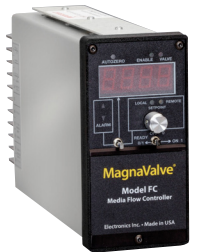
FC Controller (sold separately)