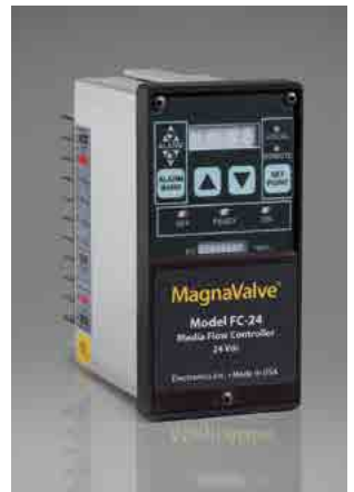
FC-24 Controller (sold separately)

EI Electronics Inc. Shot Peening Control