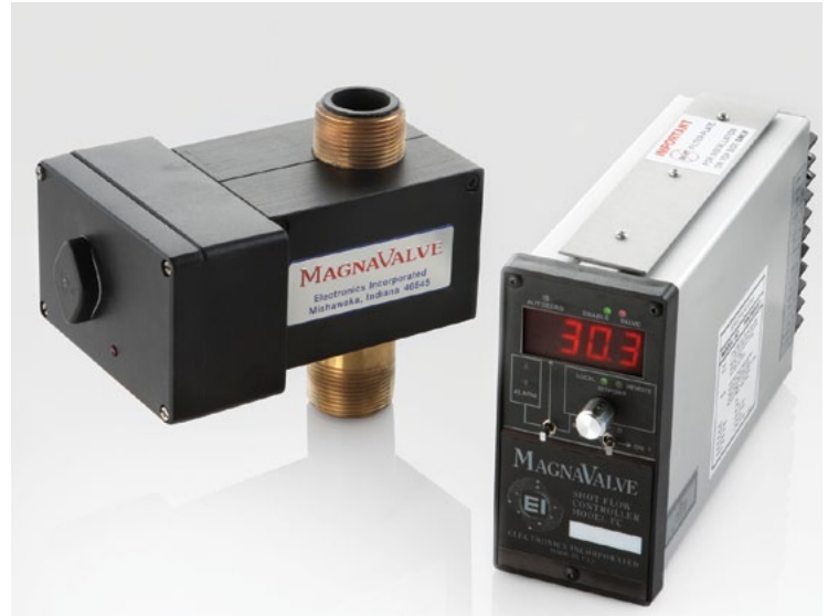
The FC Controller (right) and 120 Vac MagnaValve (left) work together to provide accurate and repeatable ferrous media flow rates.