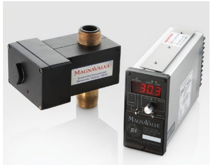
The 120 Vac MagnaValve (left) and FC Controller (right) work together to provide accurate and repeatable ferrous media flow rates.

MagnaValve is a trademark of Electronics Inc.